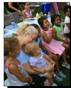
(2008 Clare House Summer Picnic Photos)